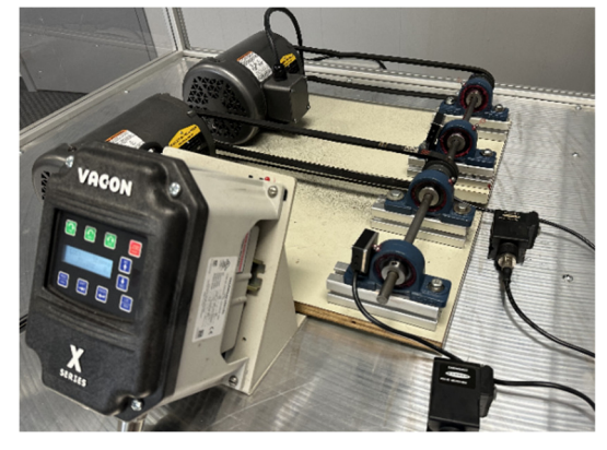
Figure 1 Test Assembly

Since these fixtures were not spinning a heavy load, a simple V-belt and pulley araingment was used to drive the shafts.