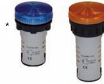
High Lens Pilot Light