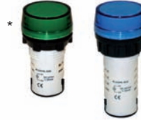
Low Lens Pilot Light