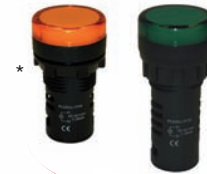
Teeth Lens Pilot Light